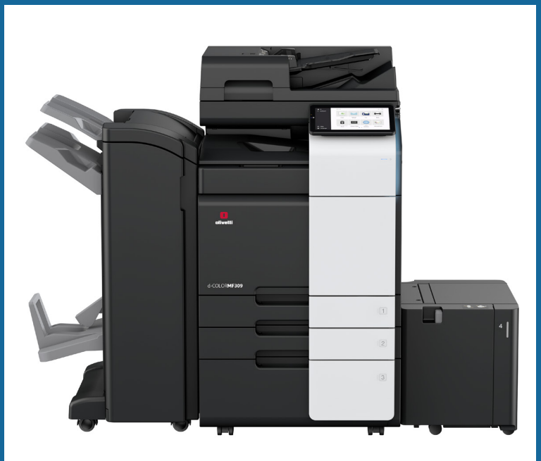
d-Color MF309 with DF-714+PC-416+LU-302+RU-513+FS-536SD

New 10.1" multi-touch operator panel, which can vibrate to provide greater touch sensitivity